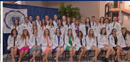
Trine MPAS Class of 2021