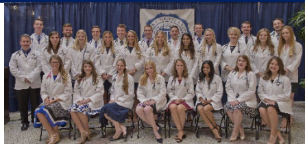
Trine MPAS Class of 2020