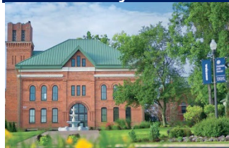
Sponsel Administration Building